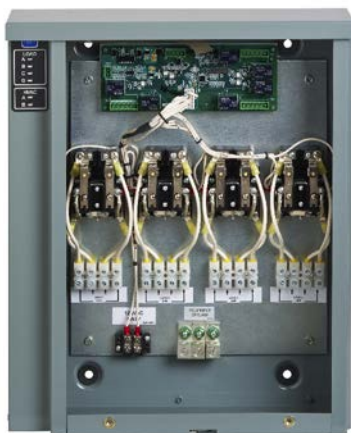
LCM with Terminal Block Connections