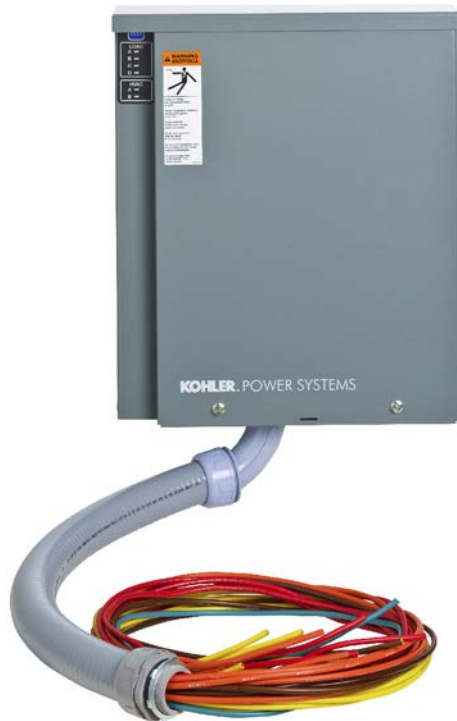
LCM with Pre-Wired Harness

ISO 9001 KOHLER POWER SYSTEMS NATIONALLY REGISTERED